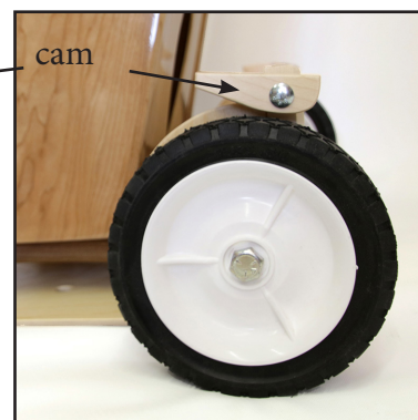
FIG. 5 Brake is OFF